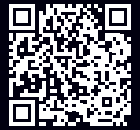
RUT281 360° VIEW

The RUT281 is a compact LTE router with a reliable Telit Cat 4 modem, engineered for stable performance and long-term operation across worldwide networks. Ensure always-on connectivity with SIM and eSIM, and use eSIM bootstrap for convenient initial profile download. Preserve network continuity with WAN failover, keeping systems online during connection loss in demanding environments. Enable flexible installations with compact 83 × 25 × 74 mm housing, ideal for space-constrained deployments.