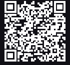
SWM280 360° VIEW